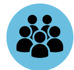
Make New Friends