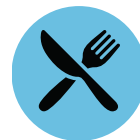
Free Hot Meal